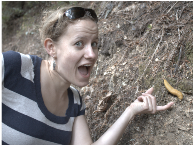
Figure 1: One possible rendering of the RAW image provided with the assignment.

For this problem, you will use the file banana_slug.CR2 included in the ./data directory of the homework ZIP archive. This is a RAW image that was captured with a Canon EOS T3 Rebel camera. As we discussed in class, RAW images do not look like standard images before first undergoing a “development” process 1 . The developed image should look something like what is shown in Figure 1. The exact result can vary greatly, depending on the choices you make in your implementation of the image processing pipeline.