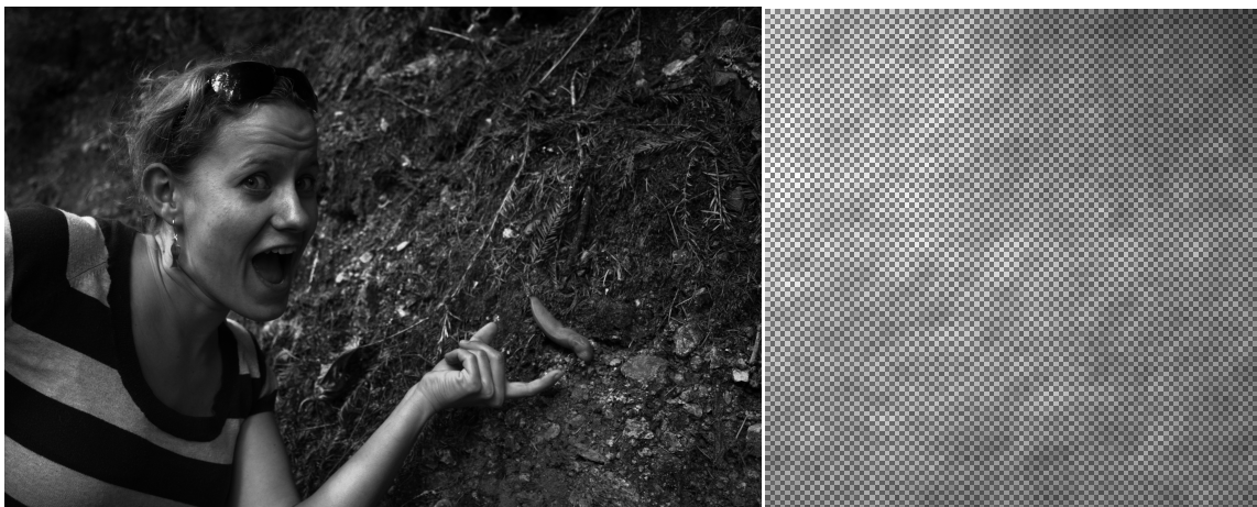
Figure 4: Left: The linear RAW image (brightness increased by 5). Right: Crop showing the Bayer pattern.